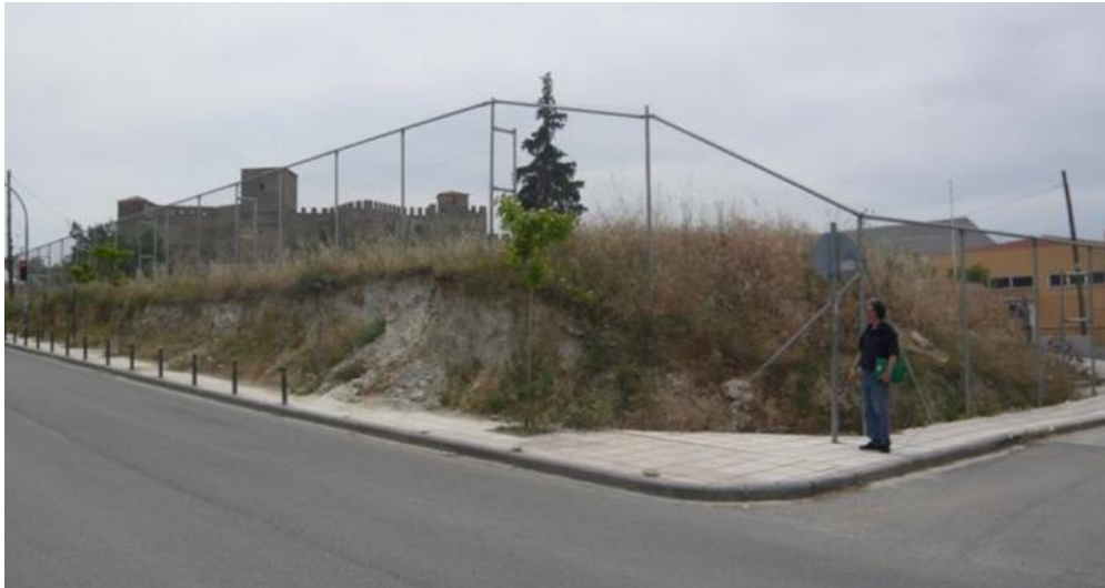
Before. Undeveloped area (view from the main road). At the back: the Eptapyrgio monument.

1st/2nd Public High School, located near the historical monument of Eptapyrgio. Municipality of Sykies, urban agglomeration of Thessaloniki/1.