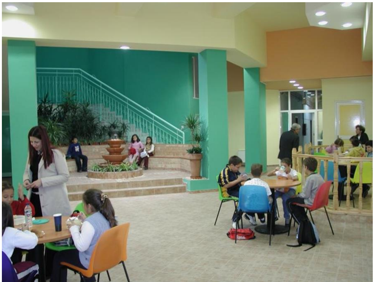
After redesign. Alternative activities hall, functioning for group activities, drama activities, art exhibitions, debates, leisure activities and lunch area.