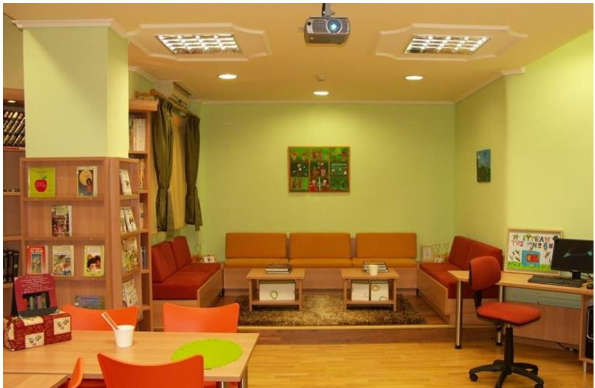
After redesign. Main pedagogical guidelines of the new learning space: creation of a "home atmosphere" and configuration of positive psychological climate for the development of the cooperative learning.