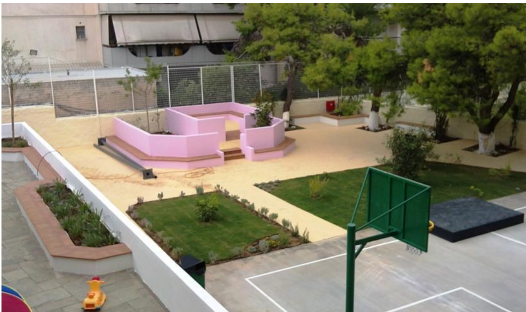
After redesign. Main pedagogical guidelines: a flexible module of outdoor spaces, which facilitates the development of several types of communication and interaction to teach or spend free time.