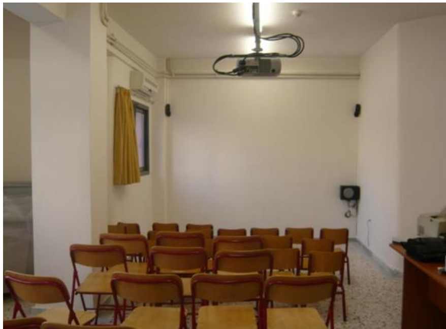
Before. Surplus classroom available for parent club meetings.