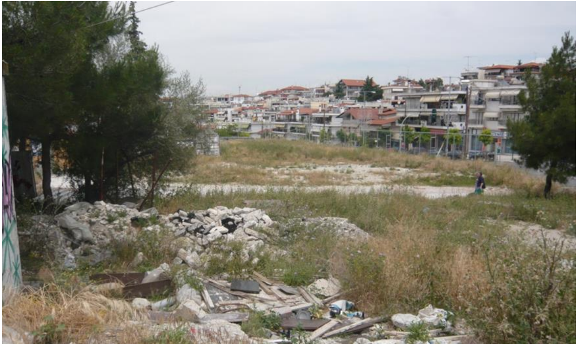
Before. The unformed space and in the background the city.

1st/2nd Public High School, located near the historical monument of Eptapyrgio. Municipality of Sykies, urban agglomeration of Thessaloniki/2.