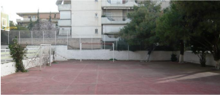
Before. The schoolyard.

“European Model”, Private Primary School. Municipality of Elliniko, Athens agglomeration.