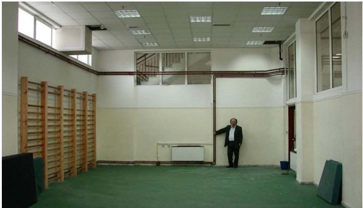
Before. Multipurpose hall, planned as a meeting hall and gym.