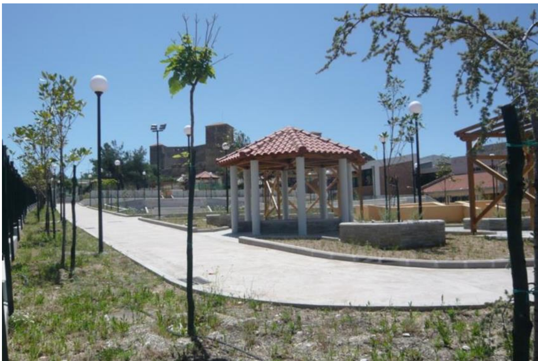
After redesign. Main pedagogical guidelines: Improve the relationship between the school and the city; development of educational and cultural activities that promote contact between children and different age groups. Internal perimeter road for sports and leisure activities from the school and, alternatively, as a promenade from the community. Inside the perimeter, areas for education and leisure activities: kiosks, seating areas, small stadium.