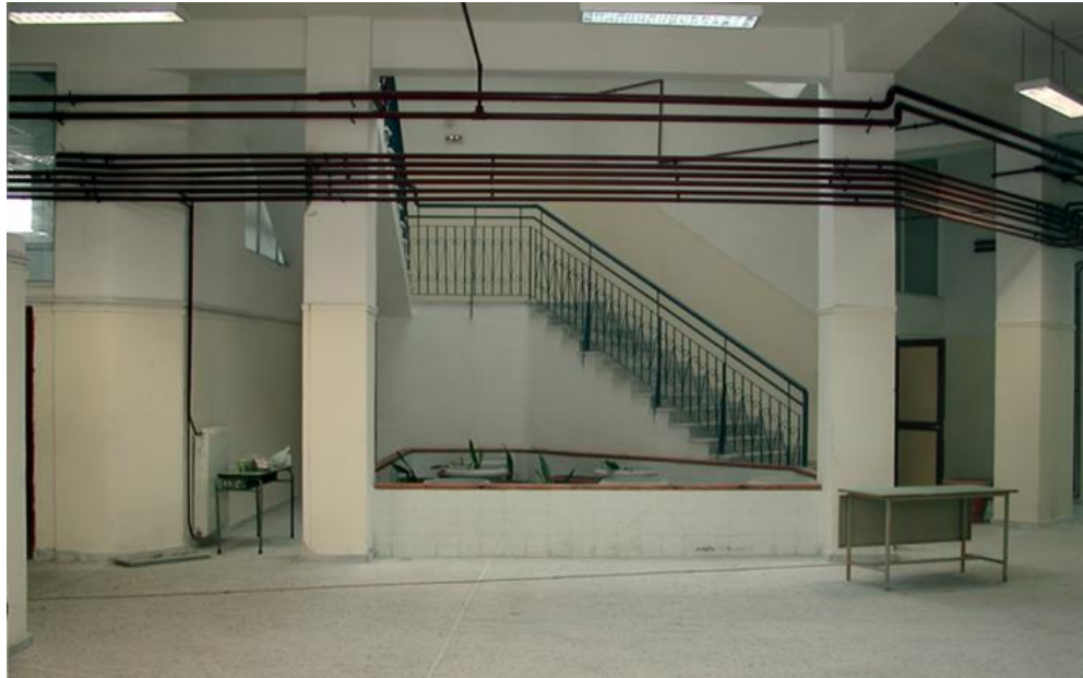
Before. The main hall, with visible heating and fire extinguishing facilities.