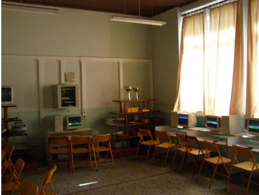
Before. A computer classroom.

9 th Public Primary School in the city of Kilkis, Northern Greece