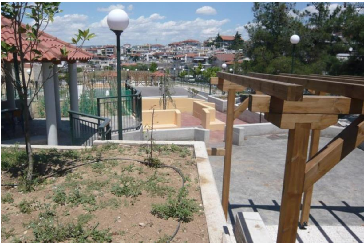
After redesign. From the same point of view, areas for education and leisure activities.