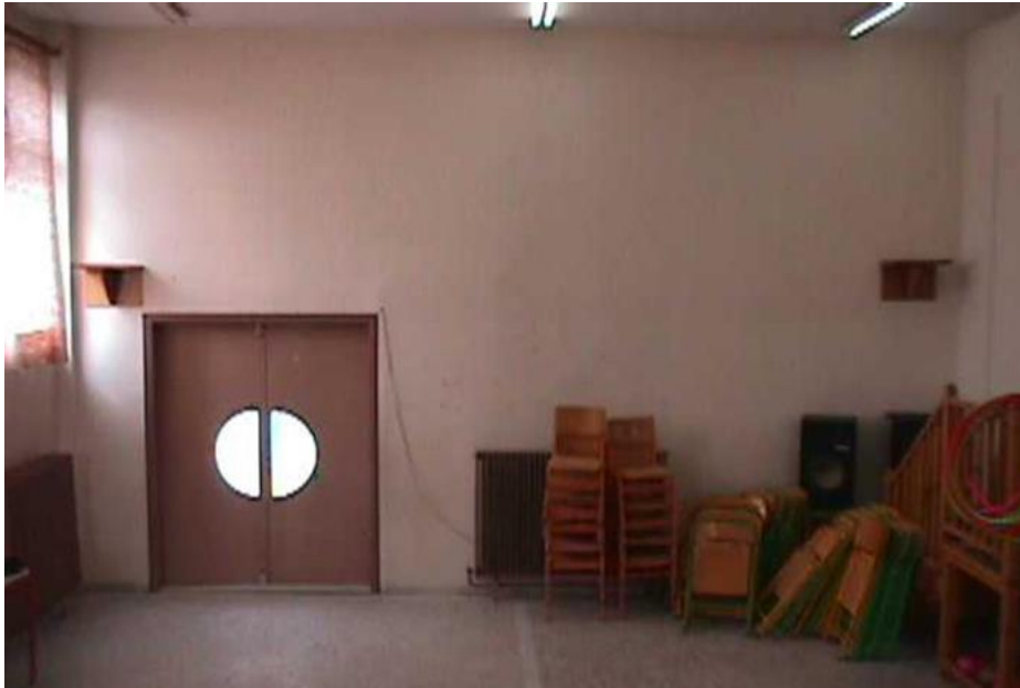
Before. The entrance to the meeting hall.