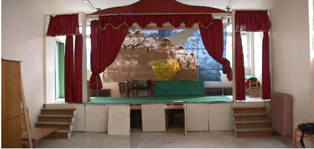
Before. A meeting hall, an ugly and depersonalized school space.

ECSC attached to the Public Primary School of Chrysavgi, Langadas, Northern Greece/1.