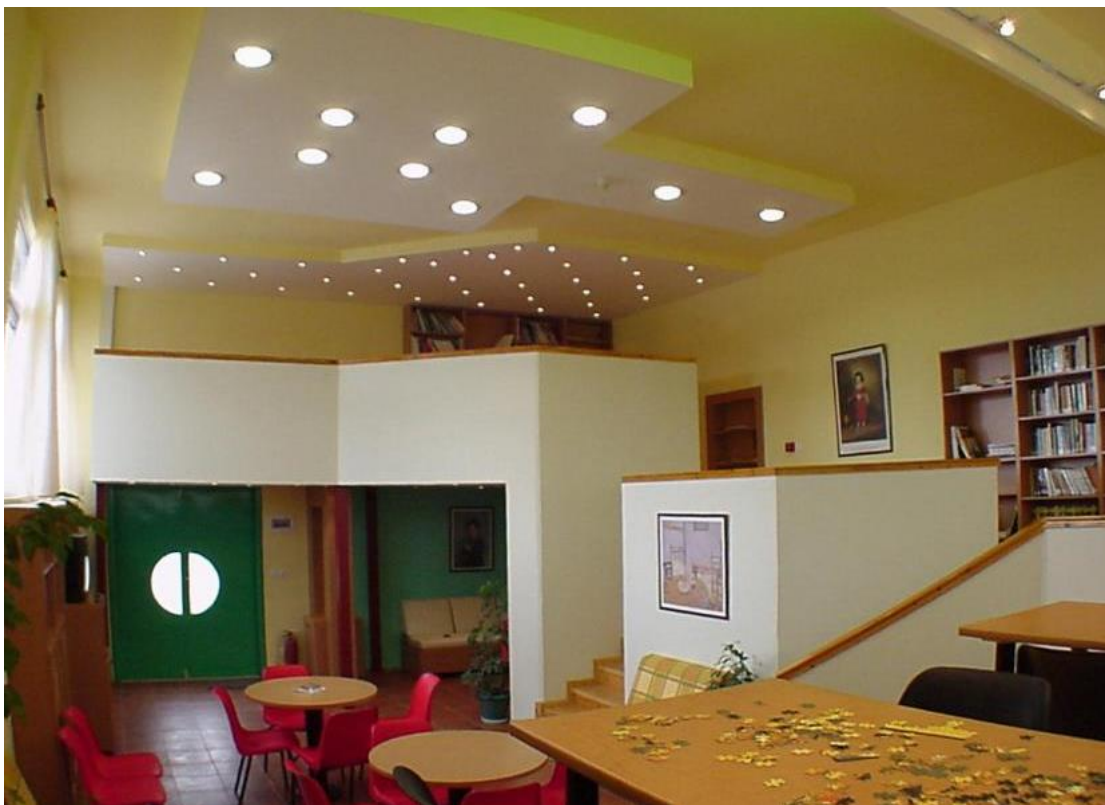
After redesign. Configuration of the space on levels, which can be used alternatively as a school library, as an area for group work & as an auditorium space for art events.