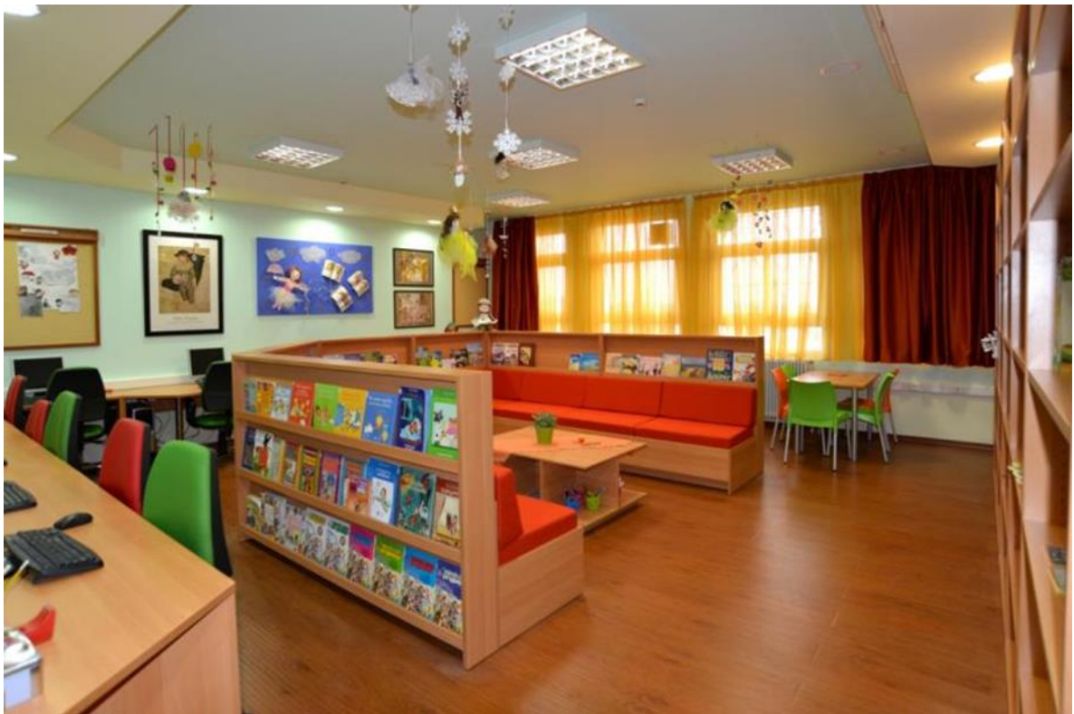
After redesign. Main pedagogical guidelines of the new learning space: the creative relation with books, the cultivation of pleasure in reading and the cooperation development.