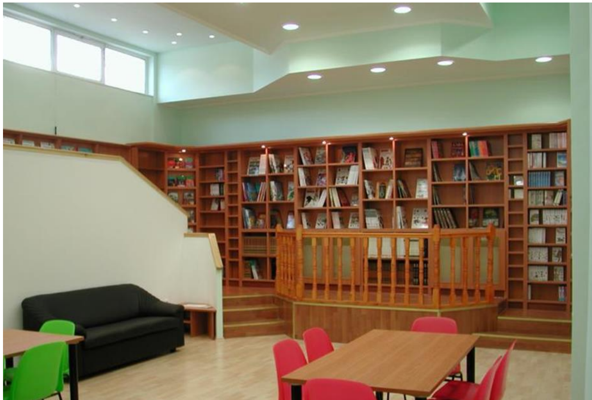
After redesign. Multipurpose hall, functioning alternately as school library and study room or as art and culture hall.